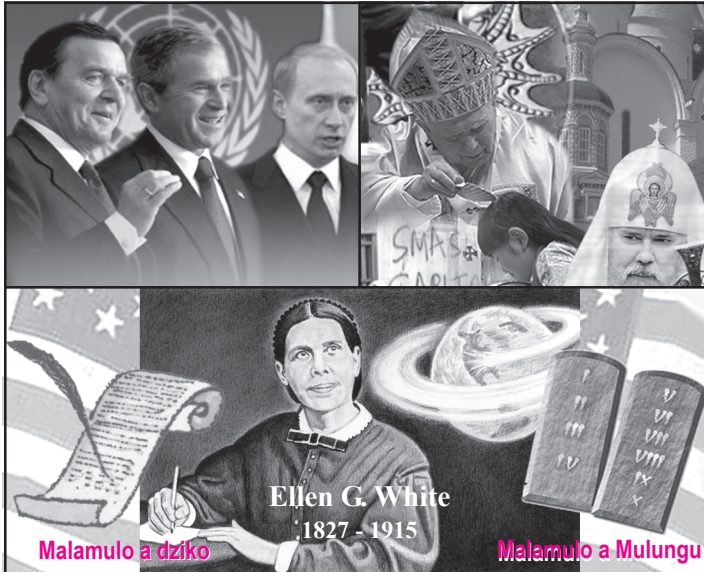
Malamulo a dziko

Ndi kobvuta kufotokoza za magwero enieni a tchimo monganso nkosatheka kufotokoza chifukwa chomwe linachitidwira. Bukhu Lopatulika likuphuzitsa momveka bwino ndi motsimikiza kuti Mulungu sanalenge kapena kutengapo gawo m'njira iri yonse za kulowa kwa tchimo m'dziko lapansi; kunalibe chosowa kapena kulephera kwa chilungamo ndi chiyero cha Mulungu pa kayendetsedwe ka boma lakumwamba, zomwe zikanapatsa mpata wa kuukira kwa mtundu uli wonse. Tchimo linadza munga chinthu chodzidzimutsa chimene malo ake panalibe pakati pa chilengedwe chonse, ndipo palibe chomwe chinaliyenera kuti lipezeke kapena kukhalako; chikanapezeka chifukwacho, tchimo likanaleka kukhala chinthu choopsya ndi cha chinsinsi. Tanthauzo la tchimo ndi lomwe likupezeka m'Mau a Mulungu; "tchimo ndilo kusayeruzika." Lisanachitike tchimo panali mtendere ndi chimwemwe pakati pa chilengedwe chonse. Zinthu zonse zinamangika pamodzi mwa ngwiro munga mwa chifuniro cha Mlengi. Lamulo la chikondi linali maziko a boma la Mulungu,