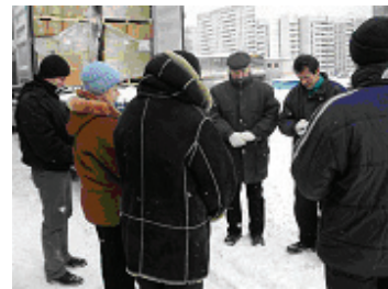
(Uthengawu ukufalikira dzko lonse. MOSCOW Pamwambapa)

"A mipingo ya Mpatuko m'dziko lapansi lonse, komanso a mpingo wa Adventist anabvomereza, Bukhu Lopatulika kuti ndilo mphunzitsi wao yekhayo wangwirowo, koma tsono m'machitidwe ao, kuyambira pamene mipingo yao inakhazikitsidwa m'zaka za m'ma 1500, ndiponso