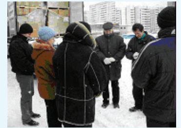
(This message is going around the world. Moscow above.)

The powers of earth, uniting to war against the commandments of God, will decree that all, 'both small and great, rich and poor,