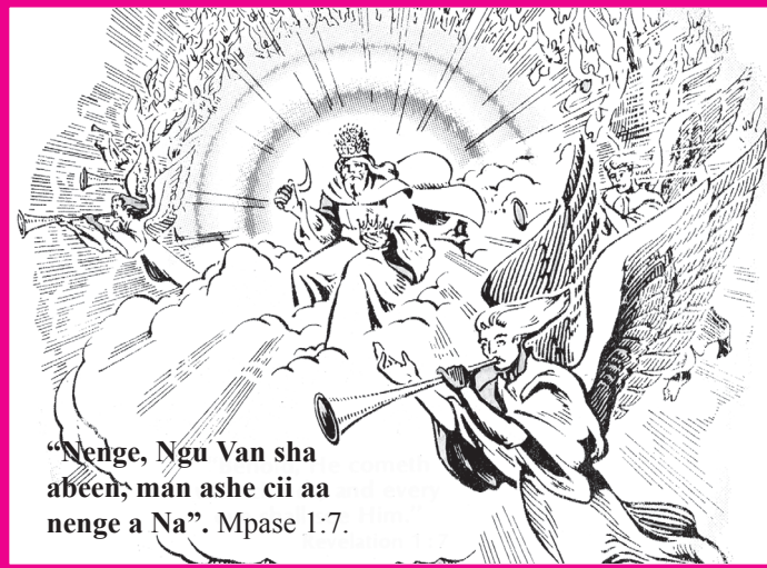
“Nenge, Ngu Van sha abeen; man ashe cii aa nenge a Na”. Mpase 1:7.

Angbianev mba doon mo shima, kwagh ngeren ne ngu sha u wasen hanma or sha er na na dondo gbenda u mimi sha ne zwa i cighan ruamabera, sha a ciu zum u Ter Yesu Kristu una hide yo, se cii se lu mba